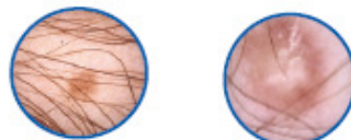
High resolution images